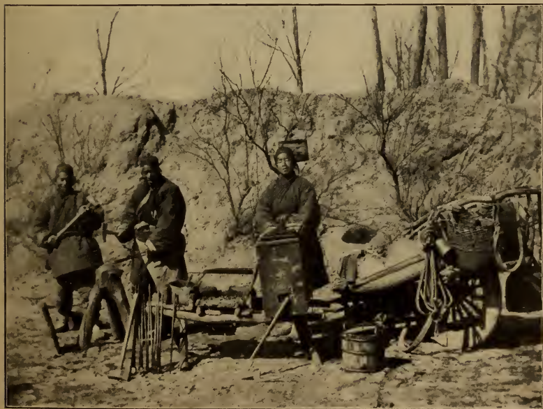
ITINERANT BLACKSMITHS EMPLOYED BY VILLAGERS.